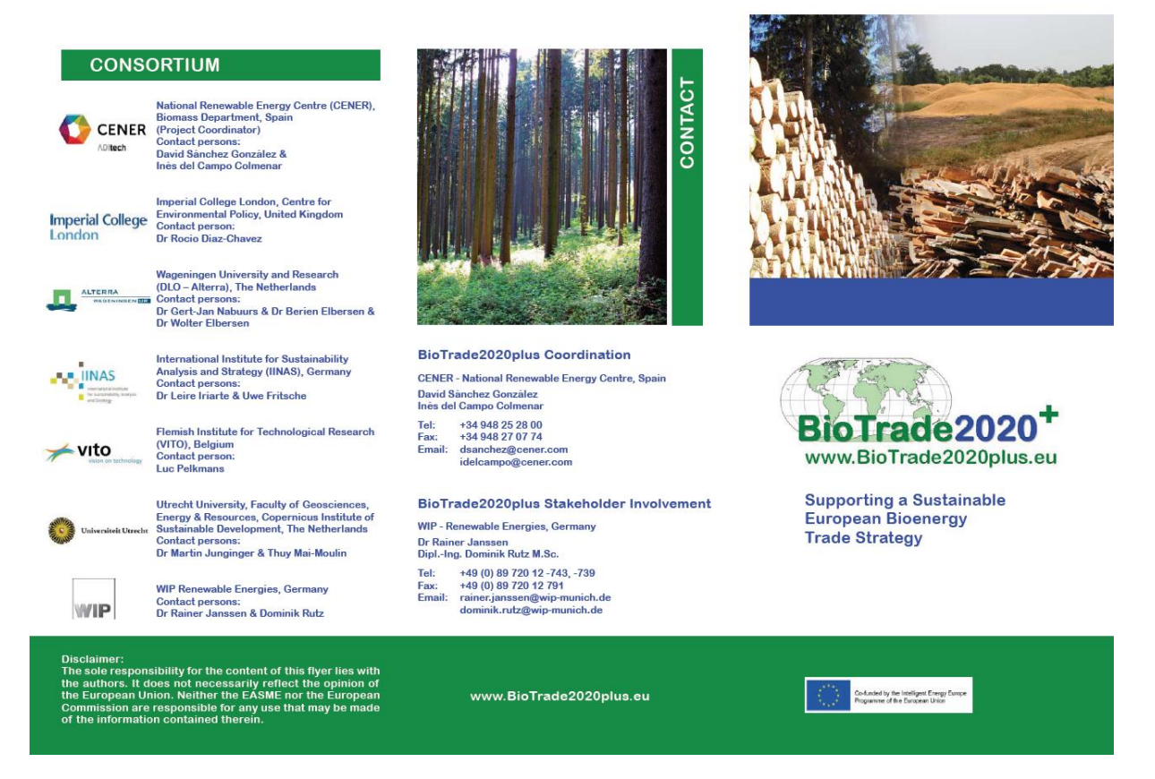
Figure 5: BioTrade2020plus project flyer

The BioTrade2020plus project flyer (Figure 5) was elaborated at the beginning of the project (D6.3, Task 6.4) to provide interested stakeholders of the specific target audiences in the scientific and industrial community with an overview of the aims and objectives of the project, namely to provide guidelines for the development of a European Bioenergy Trade Strategy for 2020 and beyond ensuring that imported biomass feedstock is sustainably sourced and used in an efficient way, while avoiding distortion of other (non-energy) markets.