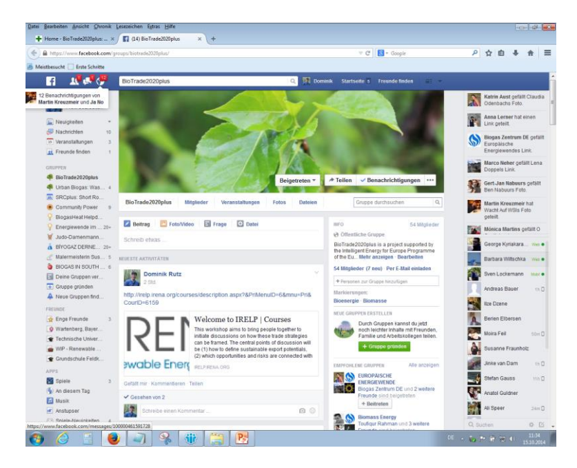
Figure 3: BioTrade2020plus Facebook Group