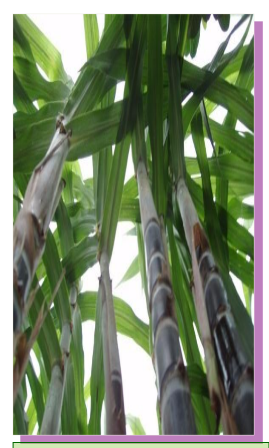
Energy equivalent of 1 ton of sugarcane = 1.2 oil barrel